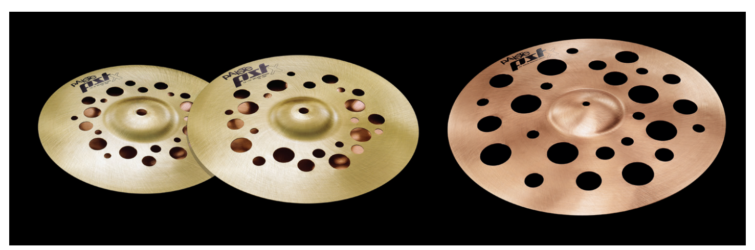
PSTX Splash Stacks / PSTX Swiss Medium Crash

PSTX are made in Switzerland from a variety of copper alloys and aluminum using a combination of modern, innovative methods and traditional hand craftsmanship that has remained unchanged in over half a century.